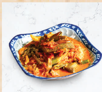
斋咖喱菜 CURRY VEGE