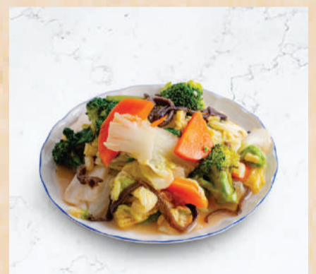
罗汉斋 LOHAN VEGE