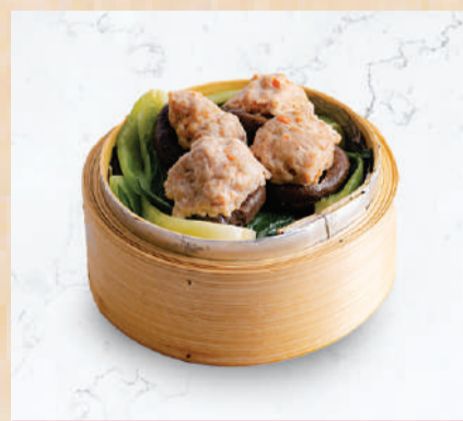
花菇小点心 MUSHROOM DIMSUM