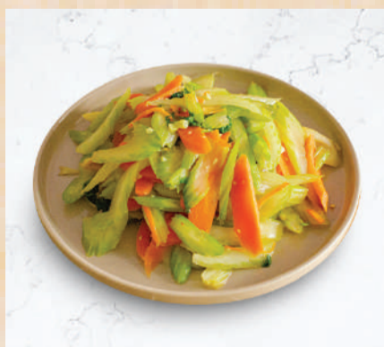
清炒芹菜 STIR FRIED CELERY