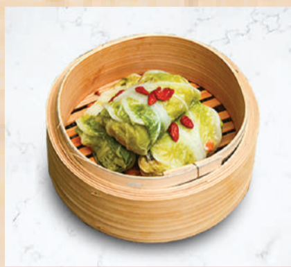
白菜小点心 LONG CABBAGE DIMSUM