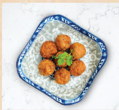
鸡肉丸马铃薯泥 MASH POTATO WITH CHICKEN MEATBALL