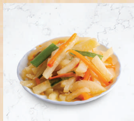
干锅沙葛 STIR FRIED SENGKUANG WITH CARROT