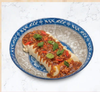
肉碎豆腐 PORK MINCED STEAM TOFU