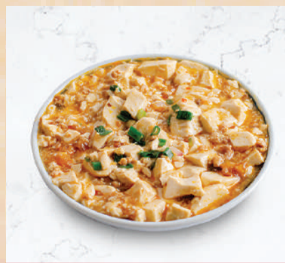
麻婆豆腐 MAPO TOUFU