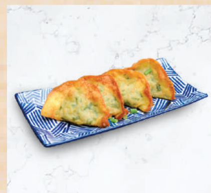
炸手工云吞 FRIED WANTON