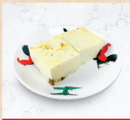
皮蛋菜譜蒸豆腐 CENTURY EGG PRESERVED CARROT STEAM TOFU